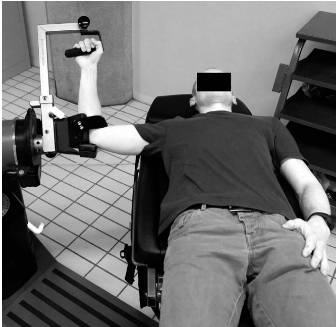
Figure 1. Isokinetic evaluation of the rotator muscles.

rotator ratio imbalance as measured by isokinetic dynamometer. Some researchers 12–14 who have included measurements of maximal isometric rotator muscle strength found an association between ER weakness and an increased probability of substantial shoulder problems throughout the season among elite male handball players 12 and ER:IR ratio imbalance among baseball players. 13,14 Therefore, the purpose of our prospective study was to analyze measurements of maximal rotator muscle strength to identify intrinsic risk factors that could put elite handball players at risk for traumatic (injury arising from contact or a fall) and microtraumatic (injury arising from overuse) dominant-shoulder injuries.